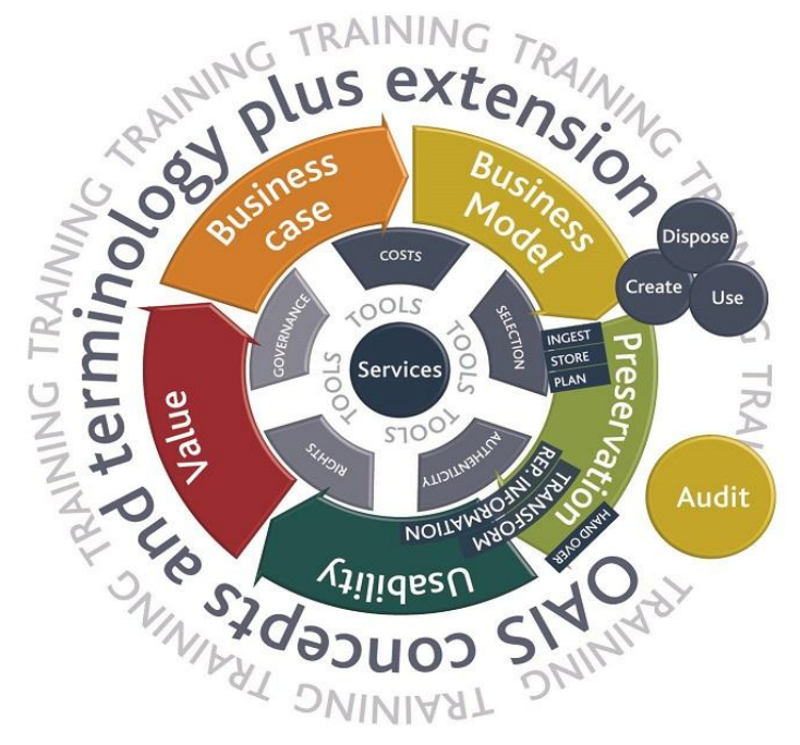
Figure 1 APARSEN Integrated View of digital preservation

The APARSEN project has produced an integrated view of digital preservation which is built directly on business processes [18].