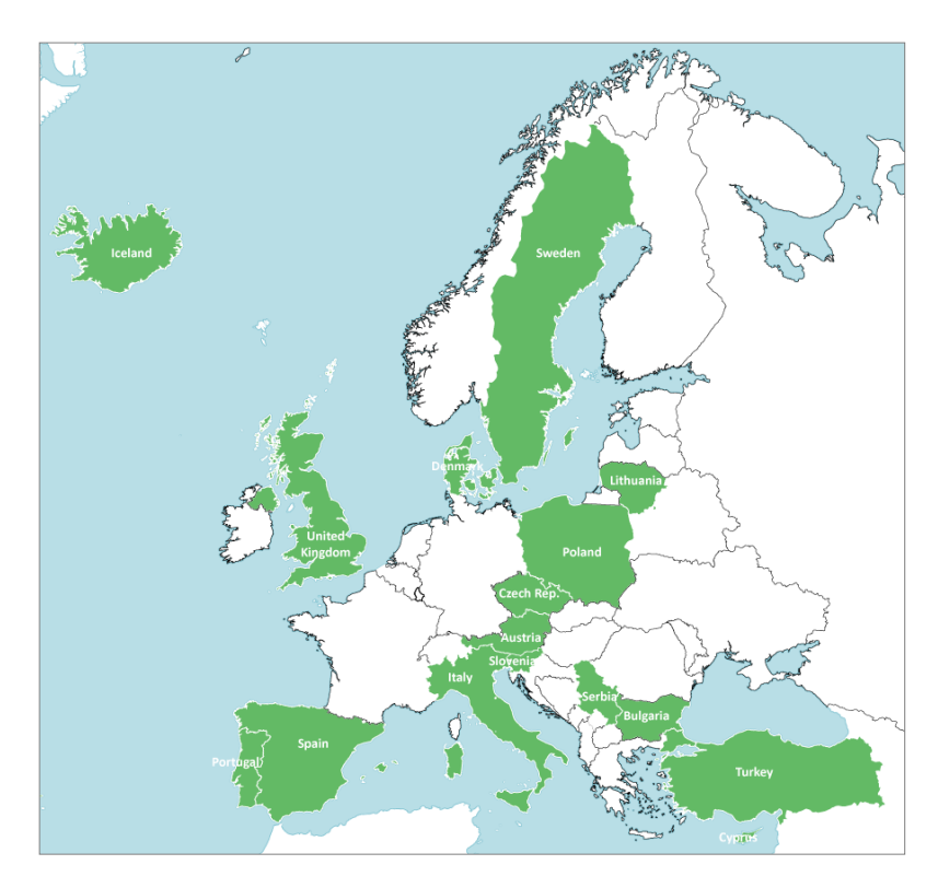
Fig 1 Countries planning to have metadata ready for ingestion in 2014

Austria, Bulgaria, Cyprus, Czech Republic, Denmark, Iceland, Italy, Lithuania, Poland, Portugal, Serbia, Slovakia, Spain, Sweden, Turkey, United Kingdom.