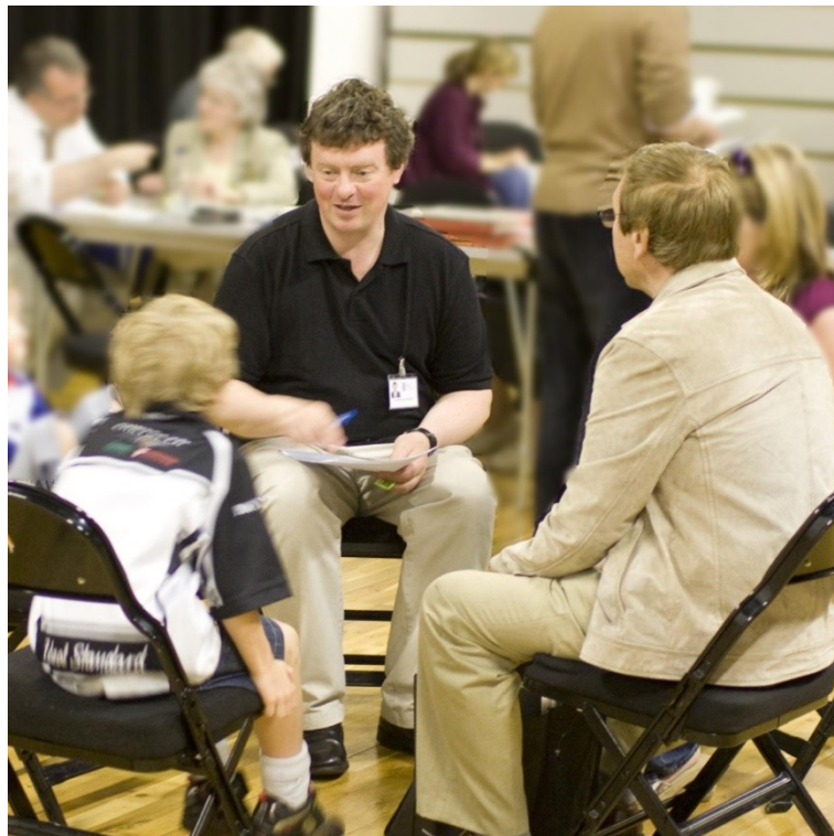
1 A volunteer interviews a family about what they have brought to the submissions day