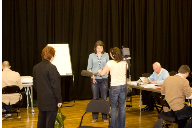
4 A news team interviews a contributor attending a submissions day