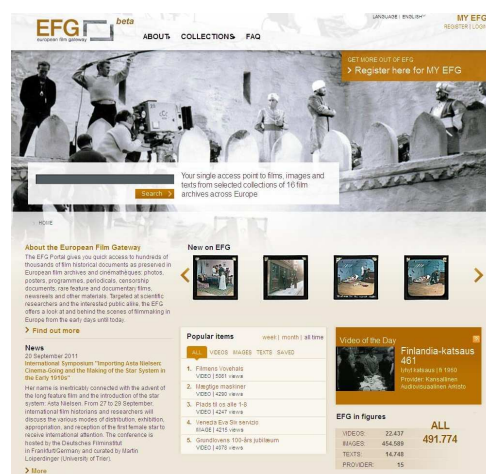
Screenshot: Start page of EFG portal

EFG provides access to material in film archives which was previously little known and in some cases not previously available online. Available content includes unique magic lantern slide collections from France, erotic films made in Austria in the early 20 th century, advertising films from Norway, newsreels from Lithuania and a comprehensive film poster collection from Denmark. Hidden treasures can be discovered from 16 European countries. Cinecittá Luce from Rome, for example, contributes not only a famous Italian newsreel collection reporting on important film-related events and persons, but also a fine collection of early films by great masters like Rossellini, Antonioni, Comencini, and other famous names of Italian filmmaking. An extensive collection of set photos to films of Rainer Werner Fassbinder contributed by the Deutsches Filminstitut is available for the first time online.