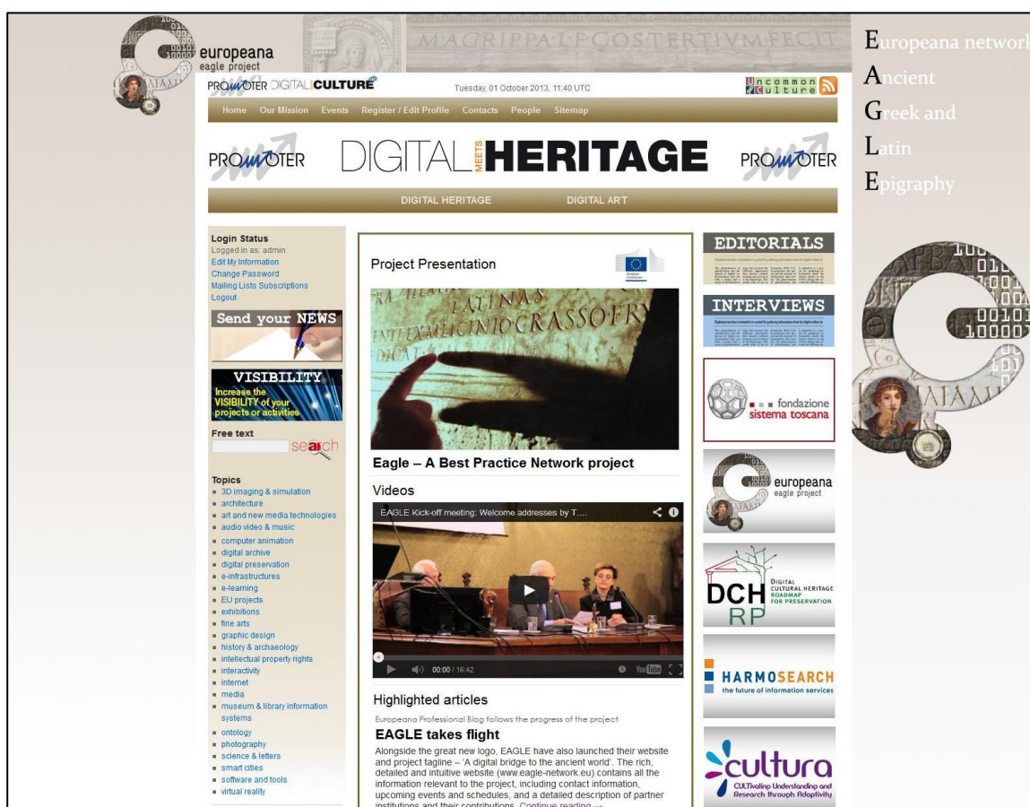
Figure 4 The EAGLE Showcase on Digital Meets Culture– Snapshot