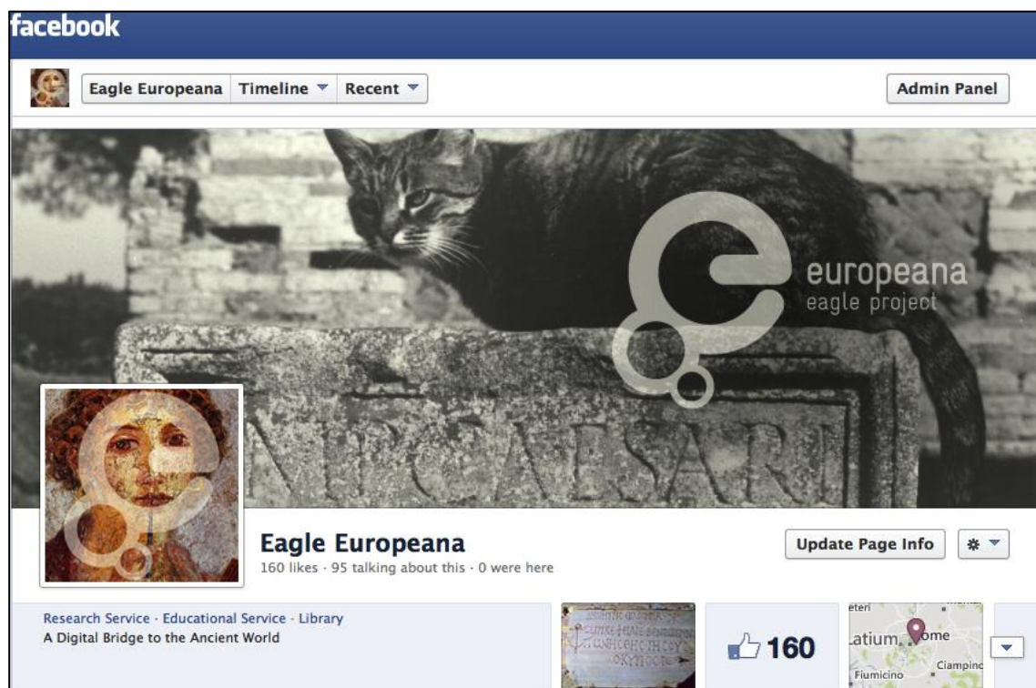
Figure 3 The EAGLE Facebook Page – Snapshot

Page: https://plus.google.com/u/0/100976832846535223203/about