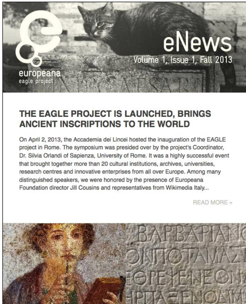
Figure 2 The EAGLE Newsletter – Snapshot